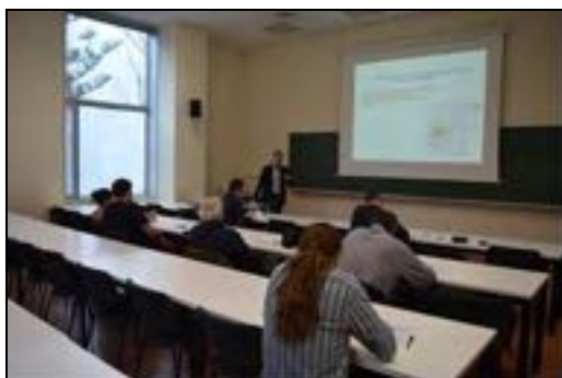
Figure 14: Meeting with CAPTOR allies at UPC

For each activity will be necessary to be developed: