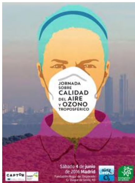
Figure 11: Poster of Symposium on tropospheric ozone and air quality

- CAPTOR presentation (video): https://www.youtube.com/watch?v=3Mf4pUo0wZo