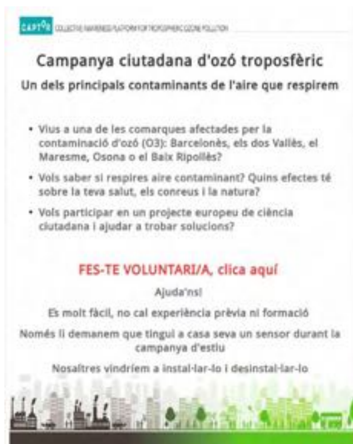
Figure 8: Call to enrol test bed volunteers for the summer 2016 campaign in Catalonia