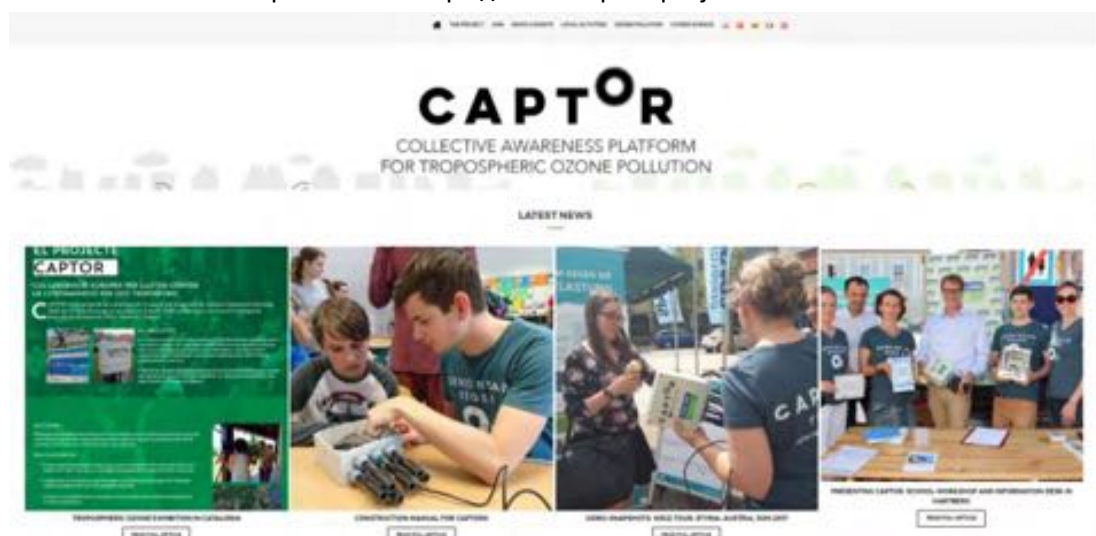
Figure 1: Home page view of the CAPTOR website