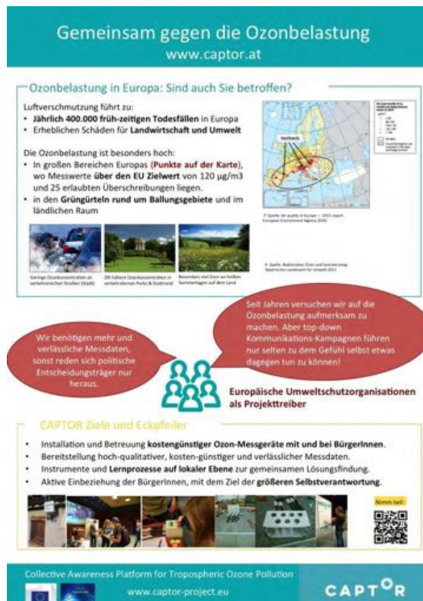
Figure 6: Poster presented at ÖSK 2016, 18-19 February 2016 in Lunz am See, Austria

A poster template has been designed that allows displaying the project approach in test bed areas; it can be adapted in each country and in specific language version; adaptation can also be done according to the audience. The following is an example of a poster presented at the annual Austrian Citizen Science Conference, February 2016. The second example is a poster displayed at the European Citizen Science Conference in Berlin May 2016.