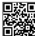
Figure 9: QR-code to have interested people registered and informed