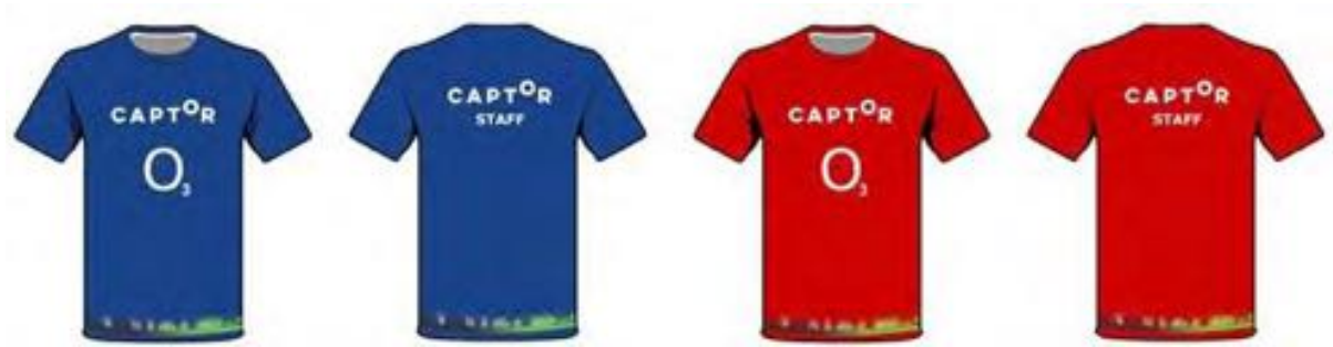
Figure 5: T-shirts for volunteers (prototype)

We have prepared a basic design for project T-shirts. As with all other dissemination material, the T-shirts will be printed locally and distributed to the volunteers, offering flexibility to the local promoters.