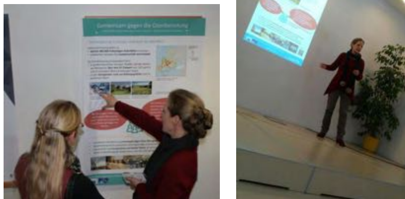
Figure 12: Presentation during ÖKCA 2016