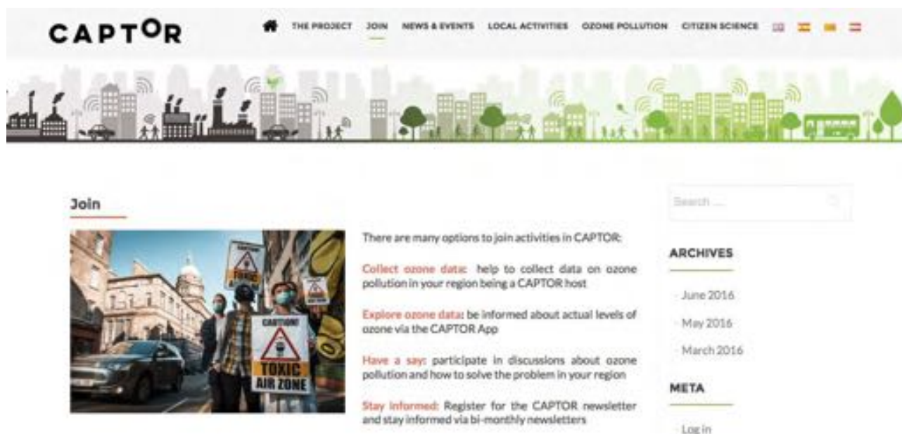
Figure 2: Another view of the CAPTOR website (the "Join" page)