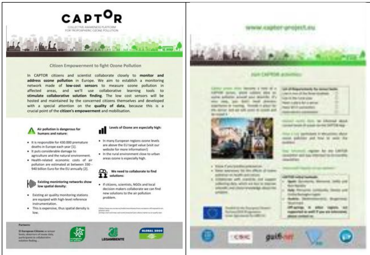
Figure 3: English version of a CAPTOR leaflet

In order to target the different types of audience the consortium partners are preparing different kinds of leaflets in specific language versions: